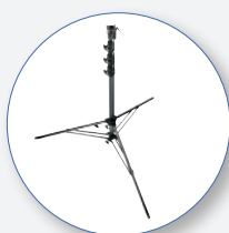
SA206 Mast for Microphone Protection Kit