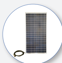
SB371 Solar Panel to Monitoring Station