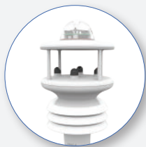
SP276 Weather Station based on GILL module