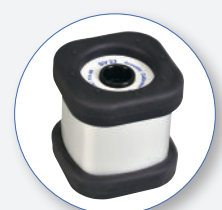
SV36 Class 1 Acoustic Calibrator 94 dB/114 dB at 1 kHz