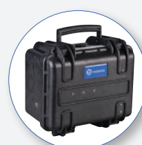
SB275 External 33 Ah Battery to Monitoring Station