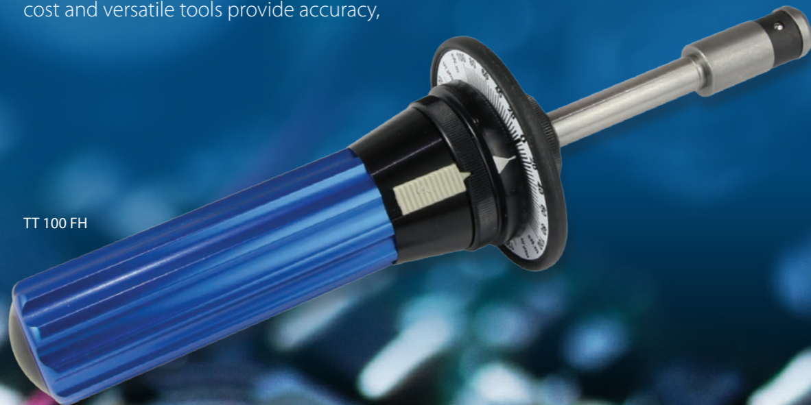
TT 100 FH

reliability and economy in a wide range of Maintenance and Repair, Quality Control, Research & Development and Assembly operations in any engineering or manufacturing environment.