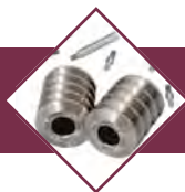
Pin Rod Standard in Case