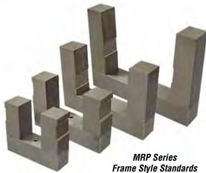
MRP Series Frame Style Standards