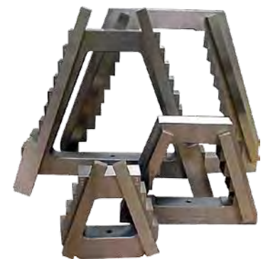
Pin and Box Step Standards