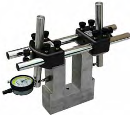
MRP Series External Frame Style Standard