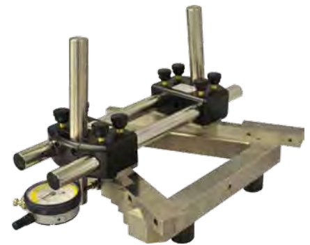
MRP-2000 on pin step standard