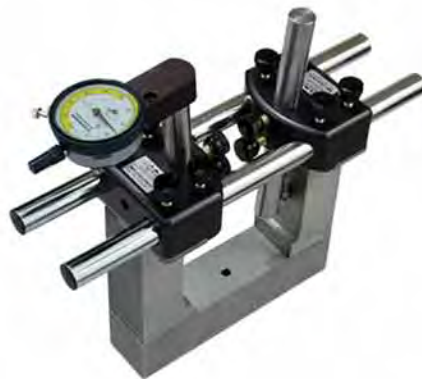
MRP Series Internal Frame Style Standard