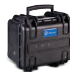
SB 272 External Battery 33 Ah