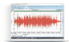
SF 277_15 License of audio recording