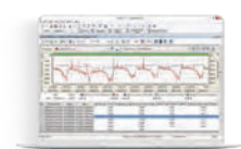
SvanPC++ EM Post-processing software