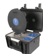
SV 111 Hand-Arm and Whole-Body Vibration Calibrator