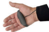
SV 105 Tri-Axial Hand-Arm Vibration MEMS Accelerometer