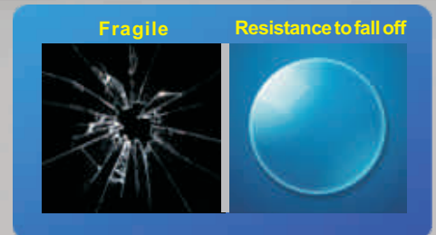
Traditional Quartz lens