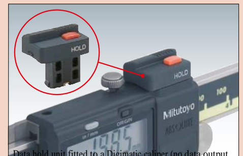
Data hold unit fitted to a Digimatic caliper (no data output possible).