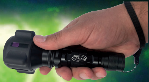
UVG3 2.0 Midlight UV-A flashlight with rubber bumper – PN: L135