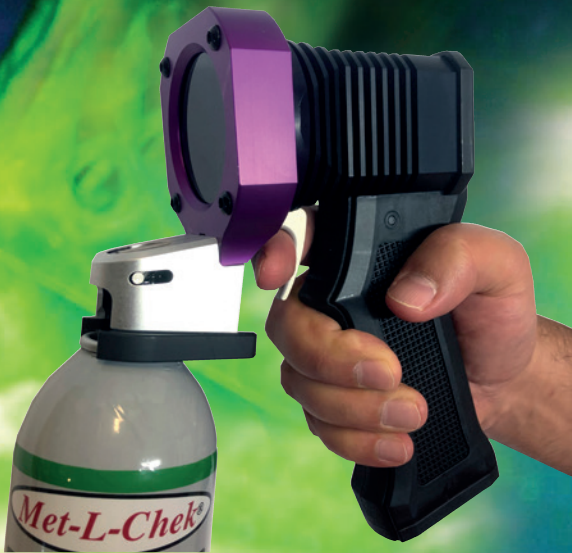
MB 3.0 Zeus UV-A & WH handheld light with Athena spray can holder – PN: L122

The ultimate inspector kit to carry field inspections in a professional and reliable manner. All UV-A lights included are tested and certified to comply with ASTM E3022-18. UV-A Lights can be replaced with other models within the same series upon request.