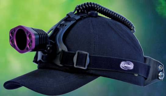
UVG5 2.0 Midlight UV-A & WH headlight with bump cap – PN: L128